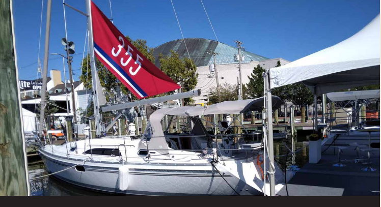
CATALINA 355 AT THE ANNAPOLIS BOAT SHOW